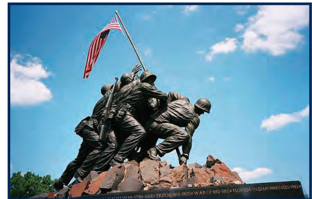
Iwo Jima Memorial