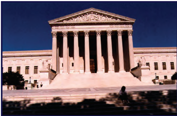
U.S. Supreme Court