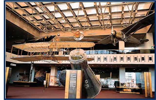
National Air & Space Museum